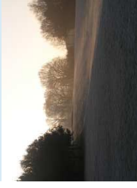
Approach to the 3 rd green

Whilst CONGU suggests 'social' golf is not taken into account for handicap adjustment this is only a suggestion and the Management Board and the golf committee believe that a more rigorous approach is justified, particularly in situations where members cannot, or chose not to play in competitions. Obviously, should any member feel that this approach has been unfairly applied a committee member will be more than happy to discuss the matter further."