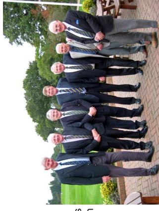
2008 Veterans Section Major Winners

Not only do we give Pro-Shop credit prizes for the top places in each of the eight "summer" months but a trophy is to be won by the member who has the best four scores aggregated along with generous cash prizes. All Vets can enter any monthly stableford which are also qualifying competitions, by just turning up on the competition date, registering before teeing-off and playing in your own groups. Usually, larger 'roll-up' groups tee off at around 8am and 11.15am if you'd prefer to take pot luck on partners.