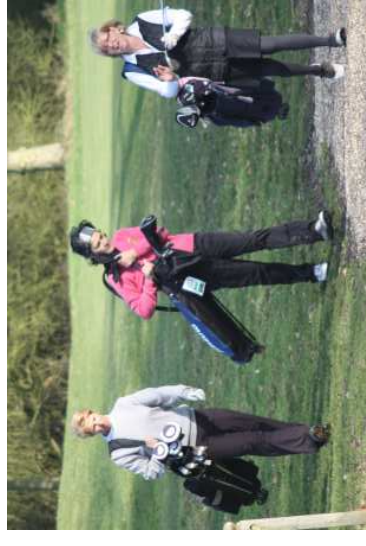
Charlie's Angels enjoying some downtime

Whilst CONGU suggests 'social' golf is not taken into account for handicap adjustment this is only a suggestion and the Management Board and the golf committee believe that a more rigorous approach is justified, particularly in situations where members cannot, or chose not to play in competitions. Obviously, should any member feel that this approach has been unfairly applied a committee member will be more than happy to discuss the matter further."