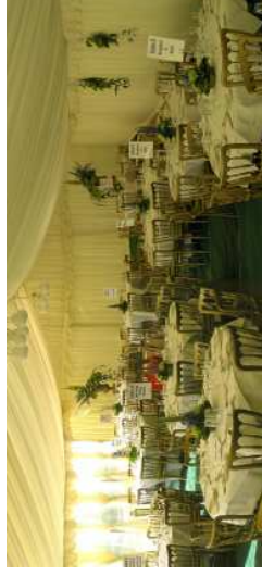
Inside the marquee on Pro-Am Day 2008

Due to the uncertainty in the economy we have taken the decision to bring forward the planning to ensure we give ourselves the maximum